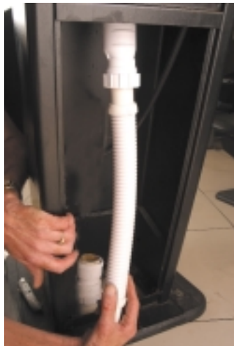
Hep v O ® The valve and flexible waste pipe